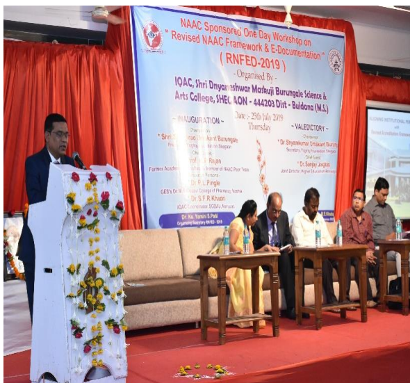
Hon'ble Principal's address