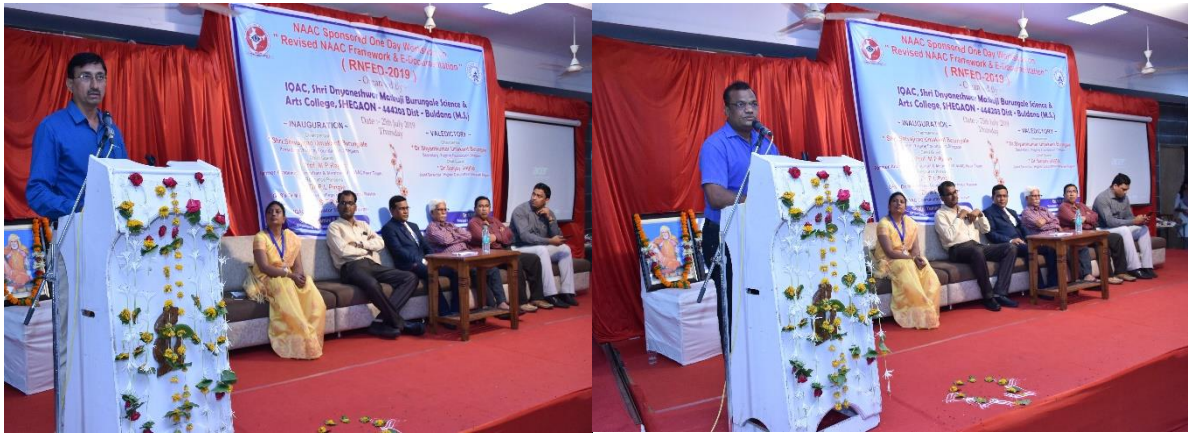
Feed Back by deligates on one day Workshop