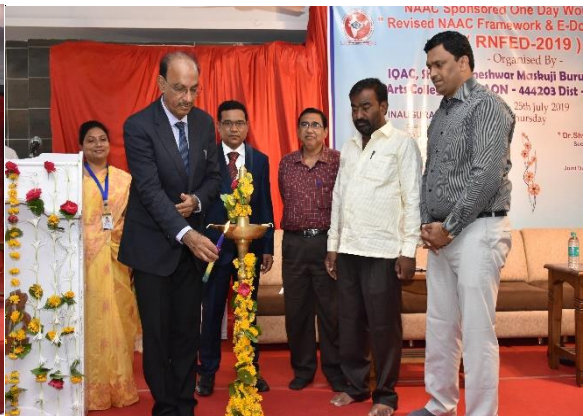
Lightning the lamp