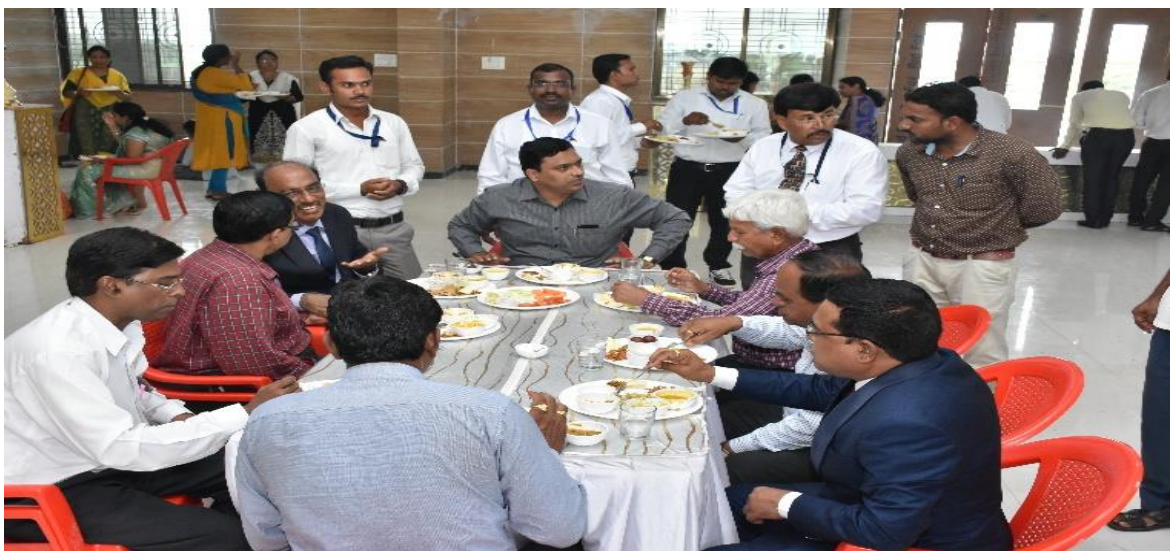
Lunch with Guest